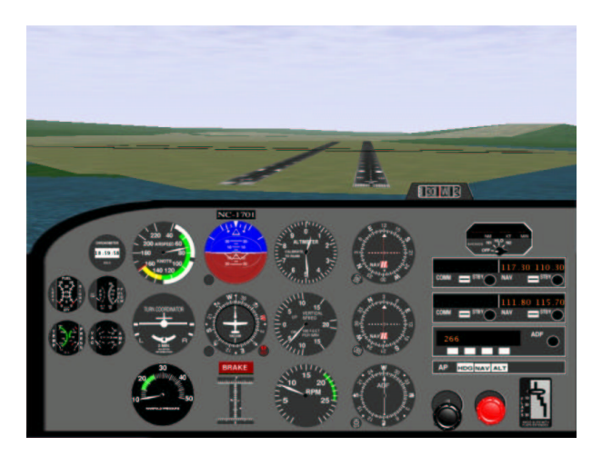
Figure 1: Cessna 172 on landing approach

The open source flight simulator FlightGear is being developed through gracious contributions of source code and time by many talented people from around the globe. The main focus of this project is a desire to 'do things right', to minimize short cuts, to learn and advance knowledge and to have better toys to play with on ordinary computers.