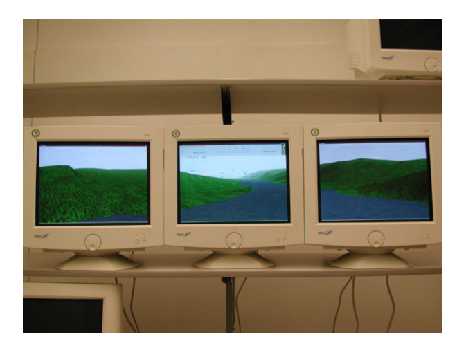
Figure 2: Panoramic scenery

FlightGear has built in support for network socket communication and the display synchronzing is built on top of this support. FlightGear also supports a null or do-nothing flight model which expects the flight model parameters to be updated somewhere else in the code. Combining these two features allows you to synchronize displays.