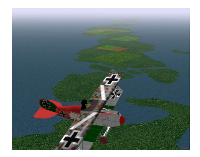
Figure 3: Tux flying over Woods Hole

Another group is developing a completely parametric FDM code base, where all the information is retrieved from XML format files. Their JSBSim project[6] can run independently of a full environmental simulation, to examine aerodynamic handling and other behavior. An abstraction layer links the object environment of FlightGear to the object collection of JSBSim to provide an integrated system. Currently, this FDM supports the Cessna 172 and the X-15 (a hypersonic rocket propelled research vehicle), providing the contrast between an aircraft used for teaching new student pilots and an aircraft that could only be flown by highly trained test pilots.